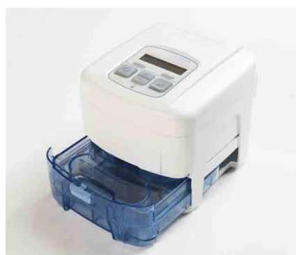
SleepCube with integrated heated humidifier