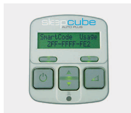
SleepCube with SmartCode display